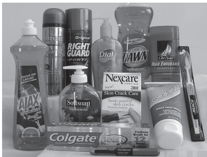
Common household products containing triclosan. See complete list on p. 4.

Triclosan has been used for over 30 years. Its uses were originally confined mostly to health care settings, first introduced in the health care industry in a surgical scrub in 1972. Over the last decade, there has been a rapid increase in the use of triclosan-containing products. 5 A marketplace study in 2000 by Eli Perencevich, M.D. and colleagues found that over 75% of liquid soaps and nearly 30% of bar soaps (45% of all the soaps on the market) contained some type of antibacterial agent. Triclosan was the most common agent found – nearly half of all commercial soaps contained triclosan. 6 While EPA does not publish total sales volume numbers, it is clear that the prevalence of triclosan in multitudes of personal care products amounts to massive quantities of active